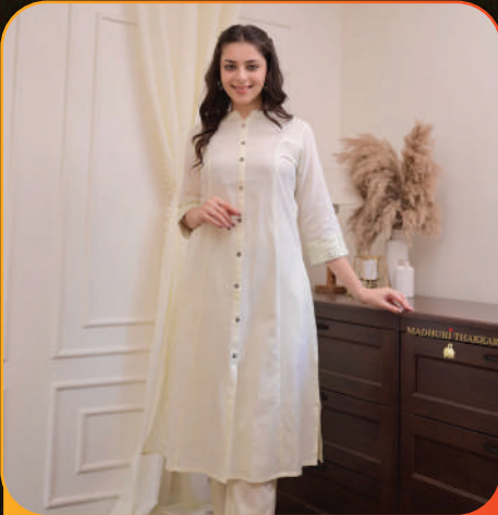
Pakistani Suit Set