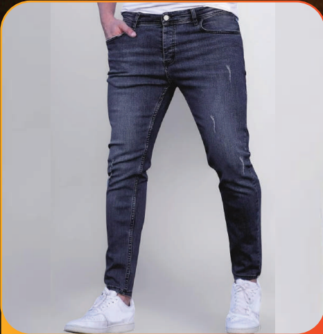
Skinny Fit Jeans