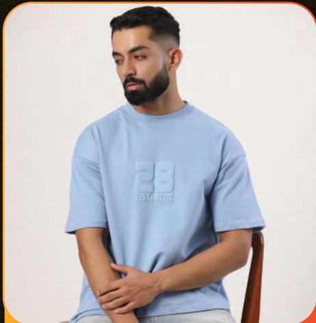
French Terry Cotton