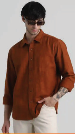
Men's Long Sleeve