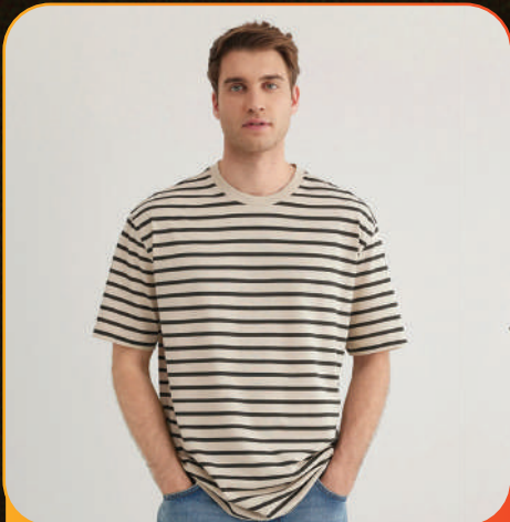
100 % Cotton