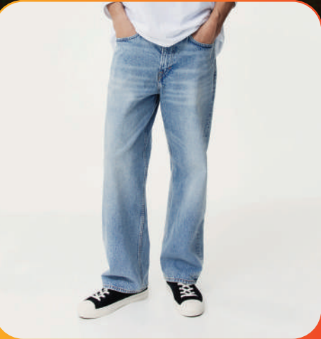
Relaxed Fit Jeans