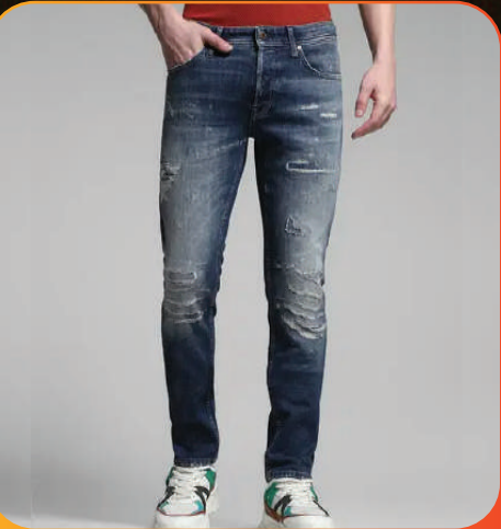
Slim Fit Jeans