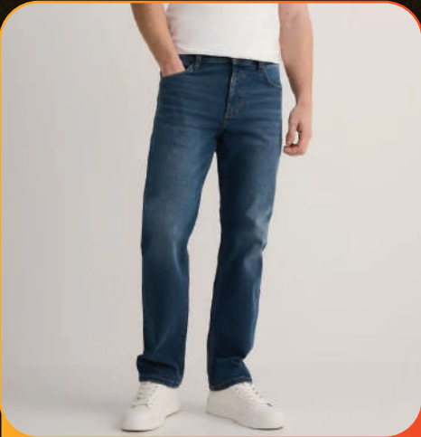
Straight Fit Jeans