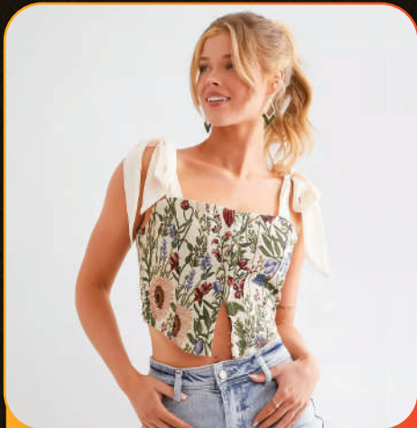
Blouse or Top