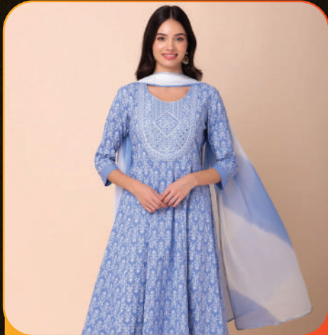
Palazzo Suit Set Anarkali