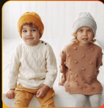
Sweaters & Jackets