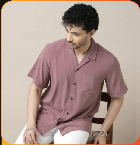
Cuban Collar Shirt