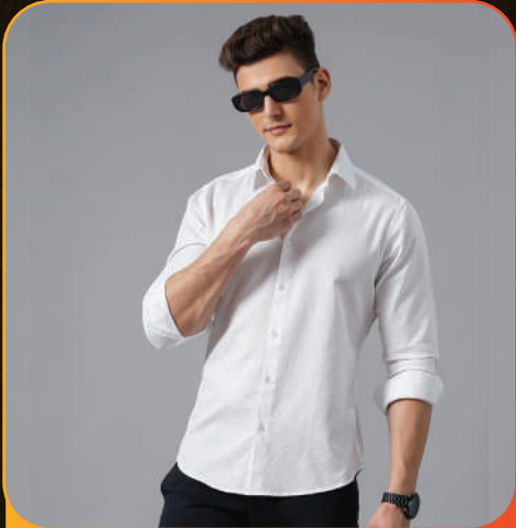
Oxford Button Down