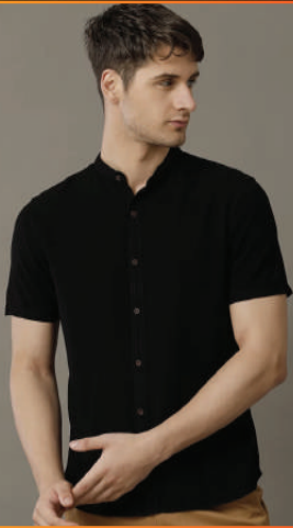
Mens V-Neck Shirt