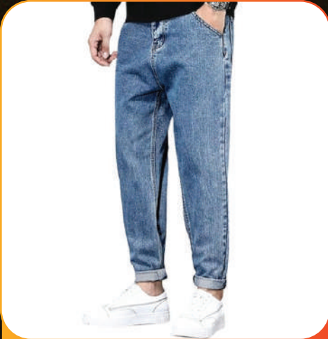
Tapered Fit Jeans